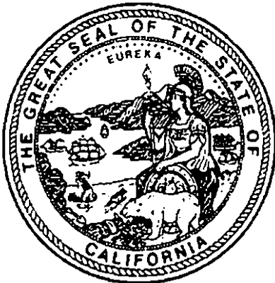
Shirley N. Weber, Ph.D. Secretary of State

IN WITNESS WHEREOF , I execute this certificate and affix the Great Seal of the State of California this day of June 10, 2022.