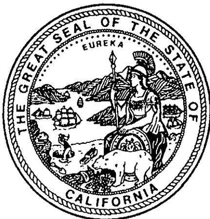
ALEX PADILLA Secretary of State

RECEIVED SECRETARY OF STATE CORPORATIONS DIV 2019 JAN 22 PM 2:44